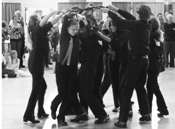
Pocket Flyers at "Celebrate Tom" on April 2 in Nevins Hall, Framingham, MA