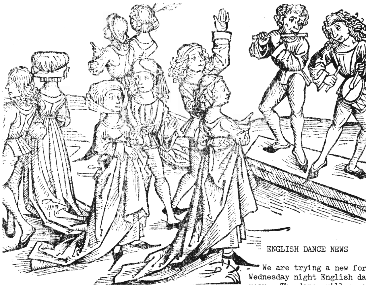
Basse danse, 1493. Note the long pointed shoes that forced both sexes to be careful in their movements.