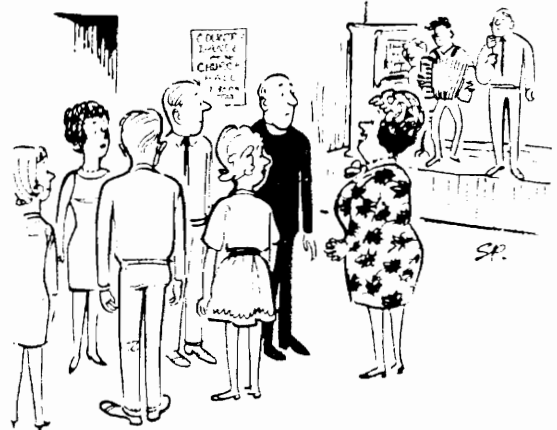
"Vicar, I feel sure you and I should be improper"